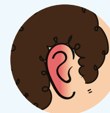
Infection in the ear

At times, fullness in the ear may be caused by fluid collected inside the ear