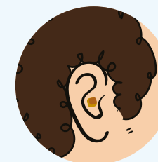
Hard impacted wax