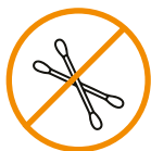
Q-tips or cotton buds